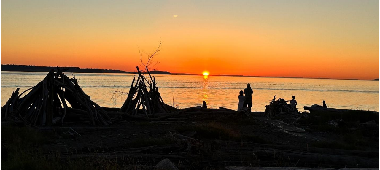
July 5 th Sunset

Website: lagoonpoint.com Email: info@lpcawa.org