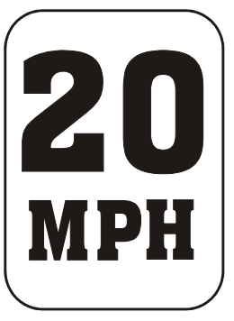
Thank You for Your Cooperation

LPIC Information Line - 1-866-590-LPIC (5742) or 678-1415