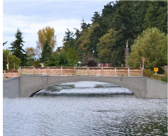
CONSPAN Photos & Renderings

the water that must be excluded using some type of impervious barrier to complete the substructure construction (dewatering). In the case of the Option B substructure, the concrete cap is above the high tide level negating or minimizing the dewatering effort.