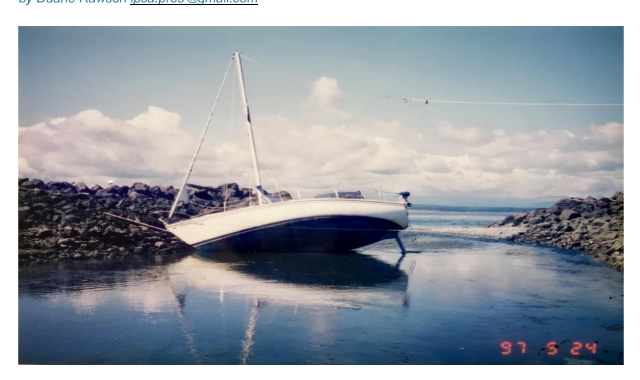
1997 photo courtesy of Jim and Larry Tuggle, Oceanside Drive

Summer time means more traffic on our waterway. Recently I was following a discussion on "Next Door Neighbor Lagoon Point" about where the fog horns we hear are coming from. Someone pointed out they are coming from ships right off our beach that are intent on avoiding collisions. To be specific they are complying with "International Regulations for Preventing Collisions at Sea" known as COLREGS 72. These regulations are often referred to as the "Rules of the Road" and they not only govern vessel movement around the world and off our beach but also within our private community waterway. Every boater should be aware of the potential for collisions especially in the jetty channel where only one boat at a time can safely transit. Deeper draft displacement vessels such as sailboats have little chance of stopping and backing out of the channel without running aground, especially on a windy day. Larger power vessels would likely not fare much better. "The Rules of the Road" address this: