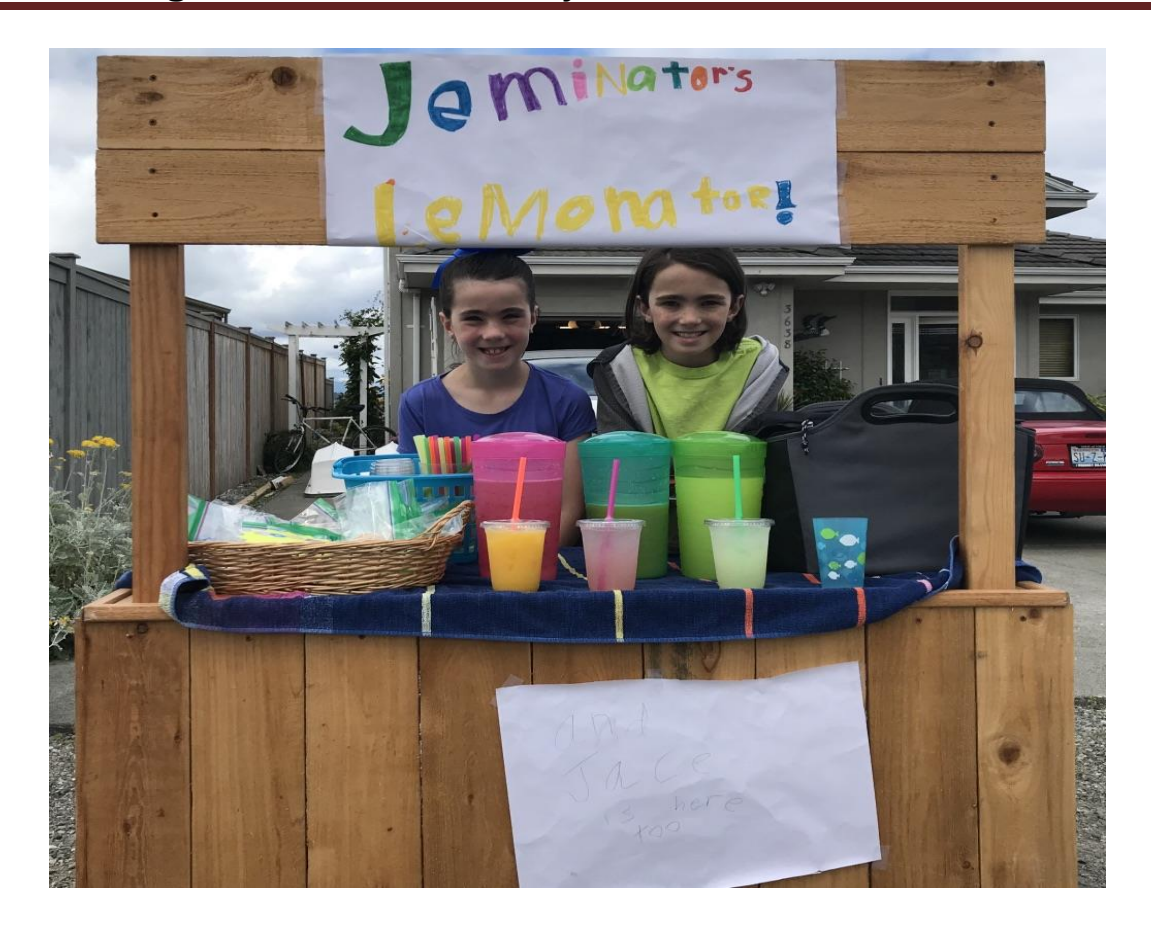
Something for everyone at the Yard Sale.